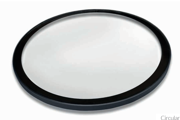
Circular or Custom Shapes