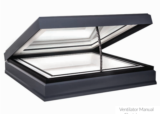
Ventilator Manual or Electric

The country's top design teams have previously chosen Lonsdale as the best available for prestigious and important buildings like the ones below: